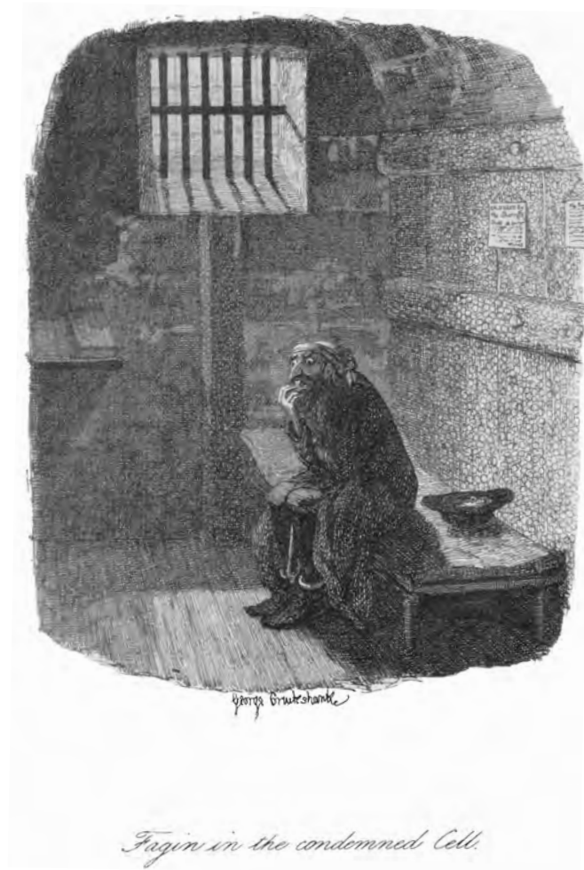
Figure 1: Cruikshank illustration from the third edition of Oliver Twist , first published in 1846