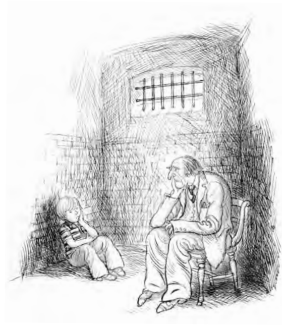
Figure 2: Illustration © Fritz Wegner from Jacob Two-Two Meets the Hooded Fang , Tundra Books