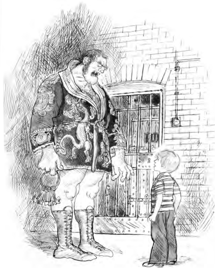
Figure 6: Illustration © Fritz Wegner from Jacob Two-Two Meets the Hooded Fang , Tundra Books