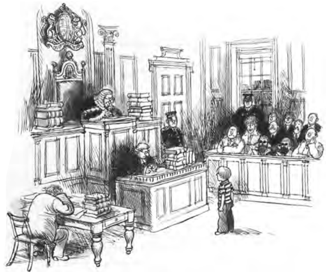
Figure 4: Illustration © Fritz Wegner from Jacob Two-Two Meets the Hooded Fang , Tundra Books